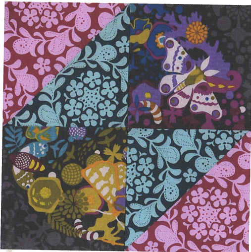
Take Two: Nichole's Block