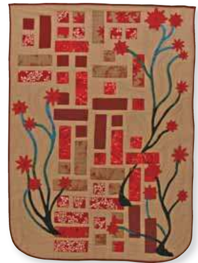
Red Brick Road by Val Garnett