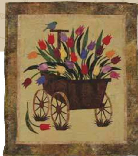
Spring Wagon by Aurea Bielby