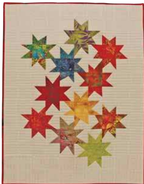
Stars of Bali by Christine Courtney

something of their own choosing. And further, the fabric choice was theirs and theirs alone, without the restrictions that normally come with a challenge.