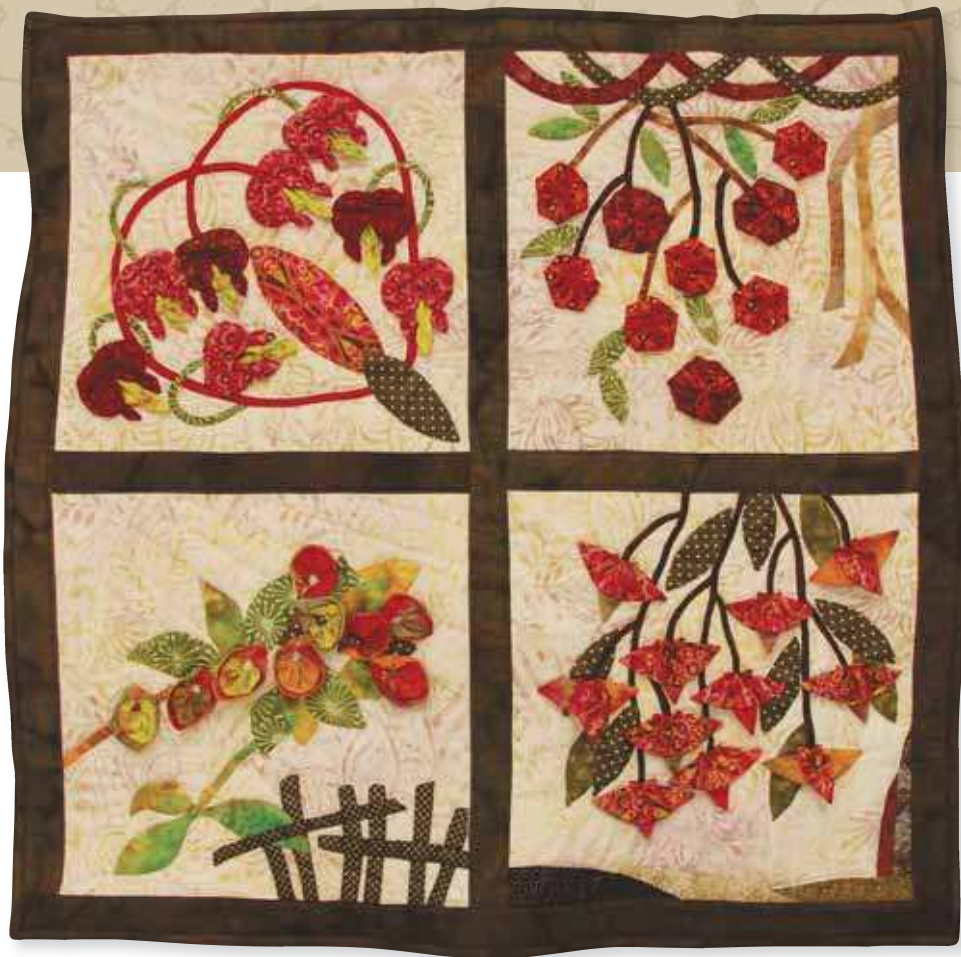
Bloomin Flowers by Kathryn Gaj