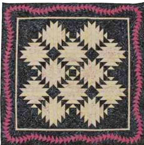
Seeking the City Lights by Barb Croucher